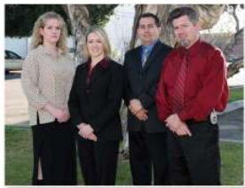
Sales Customer Service