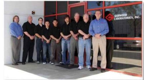
Vib/Cli/EMC/EMI San Clemente