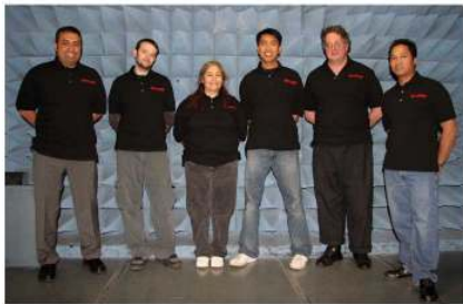
EMC Pico Rivera