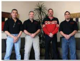
Applications Engineers Program Mangers