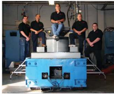
Shock & Vibration